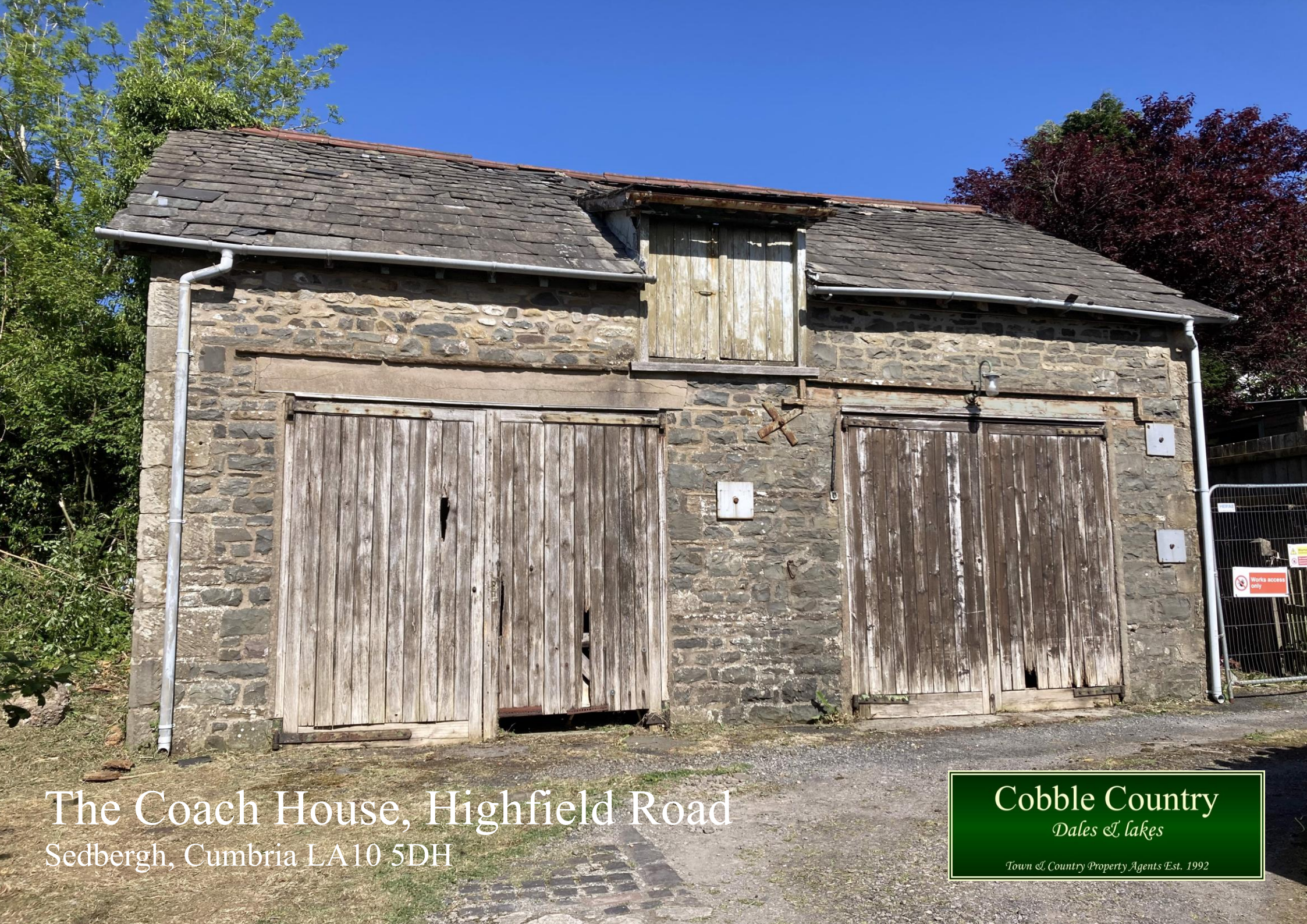
The Coach House, Highfield Road Sedbergh, Cumbria LA10 5DH